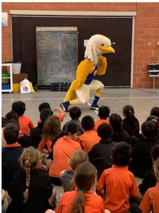
Rick showing us that he is a beautiful and strong bird 😊