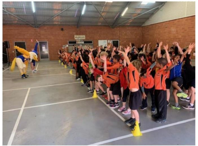
Warming up for the big event.