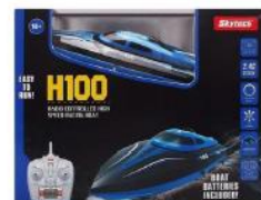
WPS P&C Remote Control Boat valued at $70