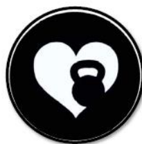
Smartt Fit 10 session group fitness pass valued at $120

Thanks to our generous local community for our raffle prizes.