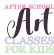
After School Art Andie Noon - Art Print