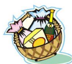
Higgs Family Wine Hamper valued at $50