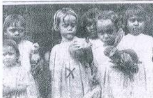
Names Are Sought For These Children

Just ask someone, anyone! "Do you think being taken from your parents and family and put into another home, with someone who looks different from you and doesn't treat you that well is alright?" What would their response be? "That's horrible!" Exactly! The children were lined up in three lines and they were split up, each line a different place to go, a different place to go. A different religion, and they had no choice whatsoever of whom to go with and where to go! That is just not fair and plain cruel. The children were taken to missions or special places in churches. To be looked after by nuns or other people and to learn to "blend in" to the white community. That is just wrong!